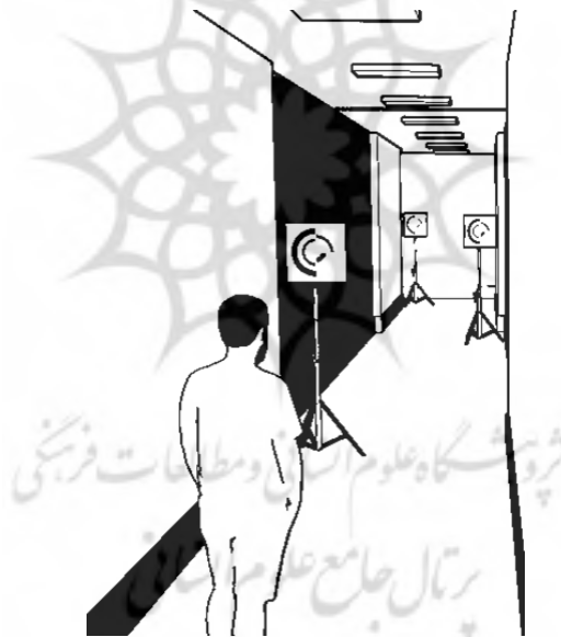
a) Participant view from starting point; b) Placement of estimation targets along corridor walls

The experiment took place in a straight, unobstructed corridor measuring 18.5 m in length, 2.4 m in width, and 2.5 m in height. The corridor was uniformly painted in matte white, and ambient lighting was diffused to eliminate shadows. No furniture, signage, or architectural features were present that could act as visual anchors or distance cues. This controlled environment was designed to isolate intrinsic distance perception mechanisms, minimizing contextual interference (Figure 1).