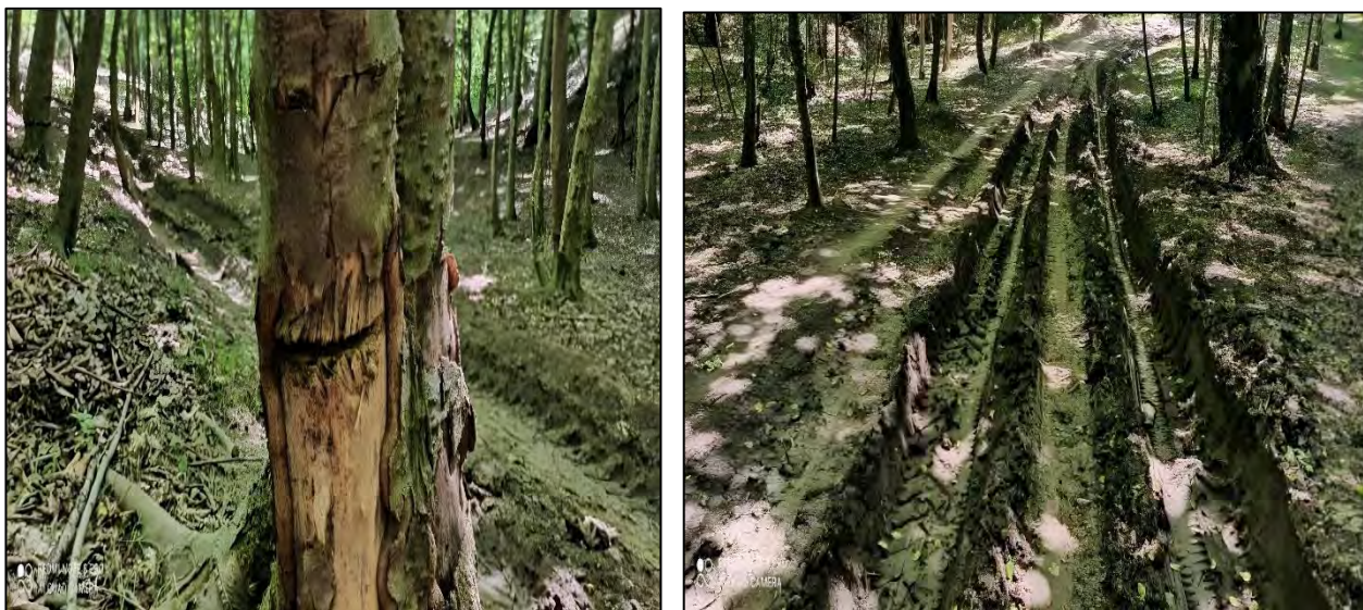
Figure 1. Some of the environmental impacts of off-roading in the forest Right - Formation of ruts in the soil beneath the tracks of off-road vehicle Left - Damage to tree trunks along the path of off-road vehicles