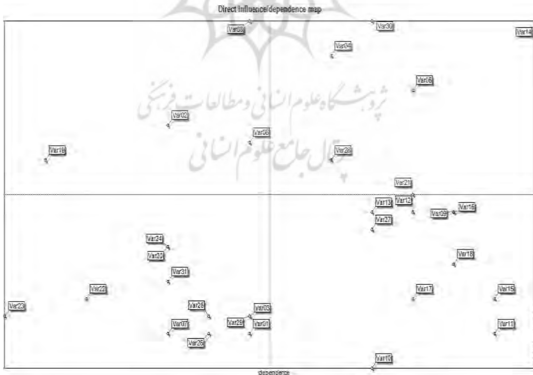
Fig. 4: Scatterplot of Productivity-Based Design Management Drivers in Selected Architecture and Urban Planning Offices in Tehran

generally reflects an unstable system. Except for a few drivers with high influence, most drivers are positioned similarly in the influential driver section.