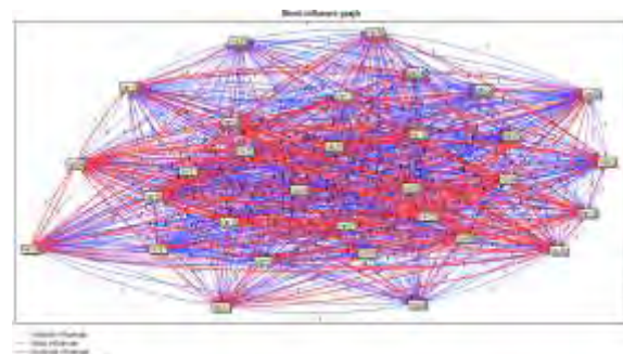
Fig. 6: Direct relationships between drivers (from very weak to very strong)