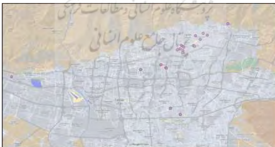
Fig. 1: The Location of the Area under Study in the Map of