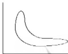
Fig. 2: Unstable System

the stable system model, the dispersion of variables forms an “L” shape; in this model, some drivers have high influence and others high dependence. In unstable systems, the situation is more complex; the development forces are dispersed around the diagonal axis of the plot, and most drivers exhibit intermediate levels of influence and dependence, making the identification of key drivers difficult (Fig. 2 and 3).