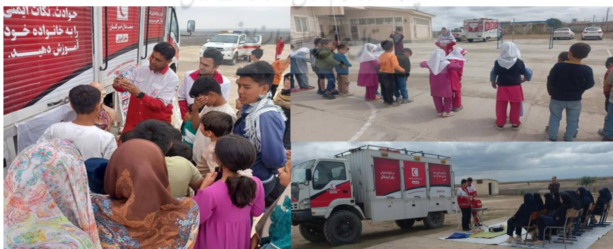
Figure 2. An example of training delivery using the "Education Ambassador Vehicle (Authors: 2025)

A comprehensive analysis of the collected data reveals a high level of participant satisfaction with the training programs delivered through the Education Ambassador Vehicle in the border areas of Gonbad-e Kavous County. Among the 135 participants, 110 (81.5%) were satisfied with the instructors' teaching quality, 115 (85.2%) found the interactive learning environment appropriate, and 125 (92.6%) confirmed the quality of the educational materials.