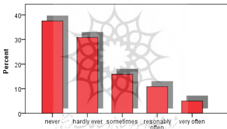
Figure 2. The rate of students' use of English outside Rabbi Rashid Higher Education College (Q. 13)

There was no correlation between students' use of the SAC and the importance of learning to learn and comprehend specialised English in an ESP course. The higher value that regular user of the self-access resources gave to them for learning to learn specialised English and comprehension of ESP materials was probably the result of their work, rather than of any preconception about SAC and SALL.