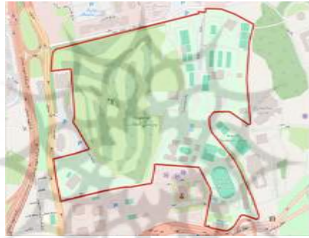
Figure 1. GIS map of the study area (Englab Sports Complex, Tehran)