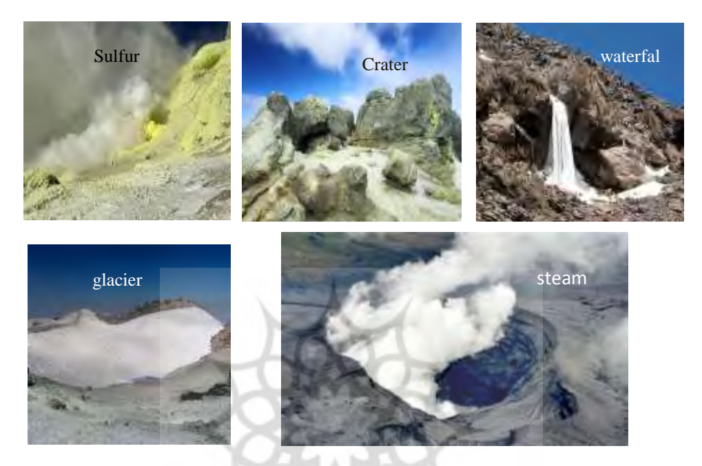
Fig 2. Images of Mount Damavand with related phenomena