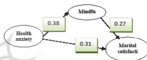
Figure 1. Structural model of the relationship between health anxiety, mindfulness and marital satisfaction

values for health anxiety (0.571), self-efficacy (0.270), and mindfulness (0.448) were less than 0.1, and the inflation factor values for each of the predictor variables of health anxiety (1.751), self-efficacy (3.704), and mindfulness (2.232) were not higher than 10. Therefore, according to Meyers et al. (2006), the tolerance coefficient less than 0.1 and the variance inflation factor higher than 10 indicate collinearity of variables. Observing the research assumption, it was possible to use the structural equation test with valid results. The final structural model and path coefficients are shown in Figures 1 and 2.