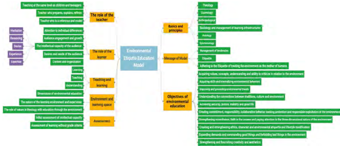
Figure 3. Environmental Etiquette Education Model from the Perspective of the Islamic-Iranian Progress Model

education model from the perspective of the Islamic-Iranian Progress Model.