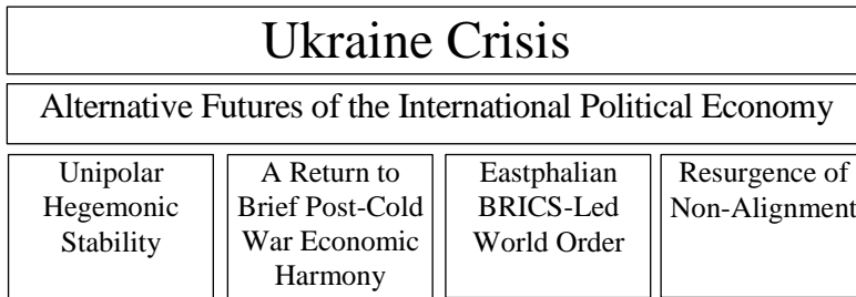
Figure (1): Four Alternative Futures Following the Ukraine Crisis