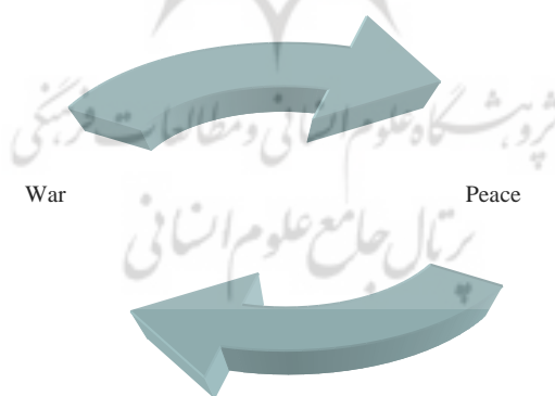
The defective and repetitive cycle of War and Peace