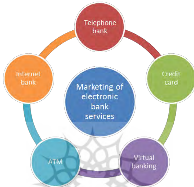
Figure 1. Marketing of electronic banking services

The marketing of electronic banking services includes three basic pillars which once established correctly, they will revolutionize the country's banking services (Khosravian, 2021). Electronic marketing is the use of electronic channels to communicate with customers to publish marketing messages. This type of marketing tries to attract the audience to the organization by using its special tools and achieving the ultimate goal of marketing (making a profit). On the other hand, in the current competitive situation, banks can take advantage of the special value of their brand to maintain and improve their position against other banks and to influence the way their customers choose some services over some other services.