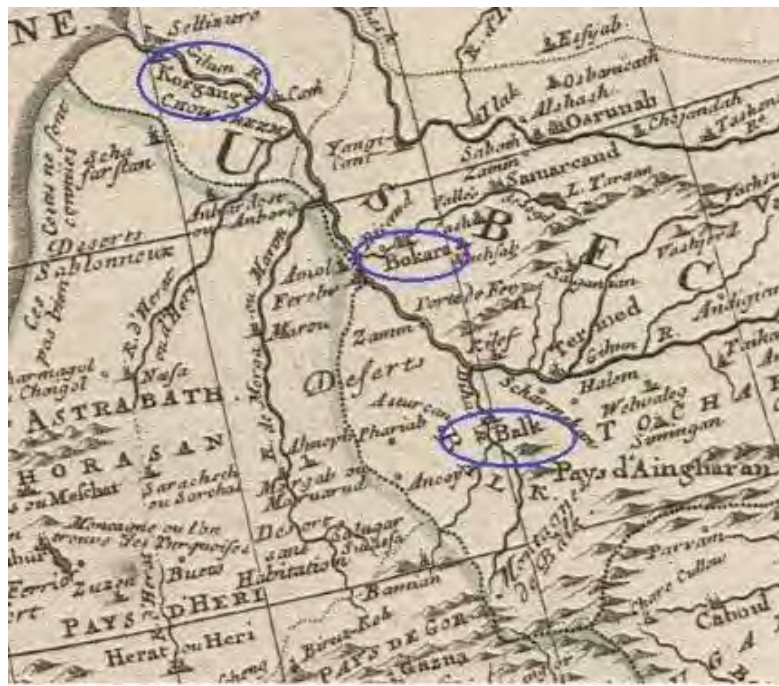
Map No. 4. The location of Jihun River, Bukhara, and Balkh on the eastern borders of the Safavids (Alai, 2010:109)