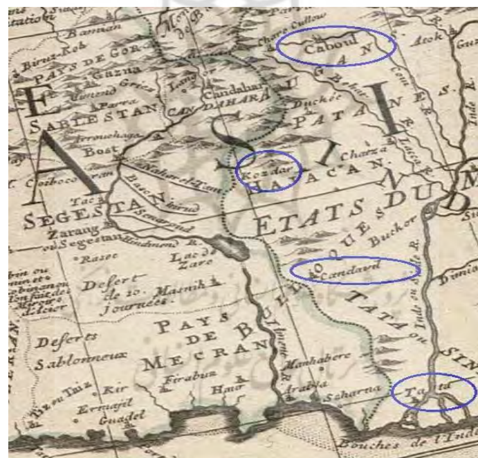
Map No. 5. The location of Kabul, Kasdar, Kandabil, and Tete in the east of the Safavid territory (Ibid)