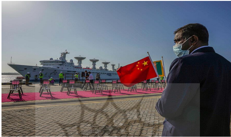
Figure (3): An Example of Seaport Geopolitics in Recent Times-Sri Lanka's Worker Holding Chinese Flag at Hambantota in August 16, 2022 before Chinese President's Arrival