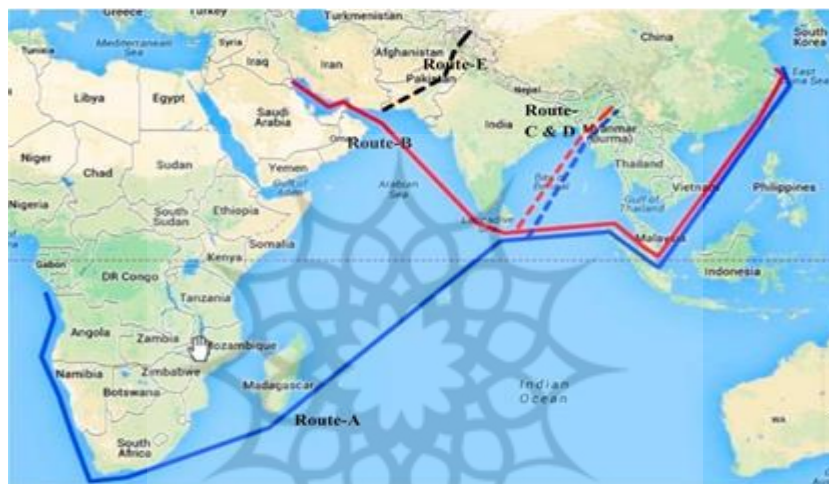
Figure (2): Oil Supply Routes from the Middle East

According to the Sirisena administration, transforming loans into equity is the only realistic route out of the debt trap. As it connects China with the Middle East and Africa and ensures that India's trade channel is not blocked, China's assistance to the Hambantota port expansion is a crucial strategic step.