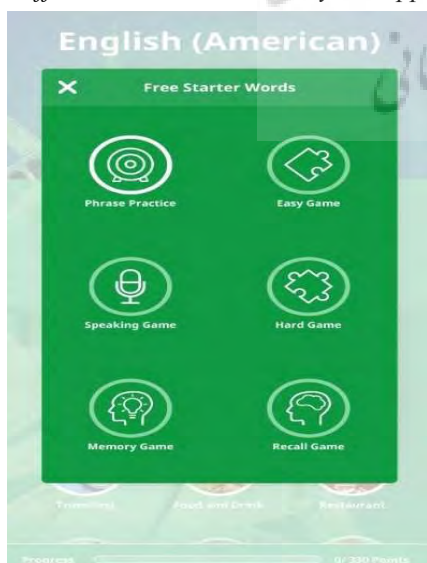
Figure 3 Different Games Provided by the App