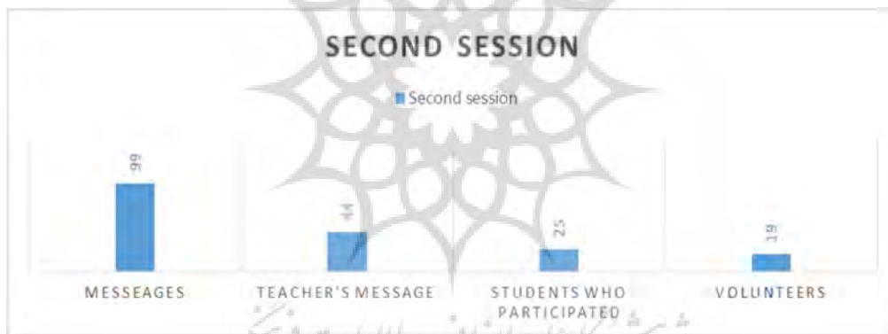
Figure 2 The Second Session's Data Collection

Table 1 presents the checklist for the class observation. Based on the following table, not all of the students participated in the class, neither the normal teaching method nor the game-based method. Some students enjoyed the games and were interested in extra games. However, there was a significant change in students' interaction patterns. Students with no or low interaction in the normal method started asking questions about games and volunteering to play games. Before sending the main activity to the class group, it was made sure that students read the instructions and answered their questions to avoid misunderstanding during the activity. Games made students more enthusiastic to interact during class time and they were more willing to pay attention to the lessons to be able to play the related games. According to Table 1, the obtained results were satisfying to both authors and the class.