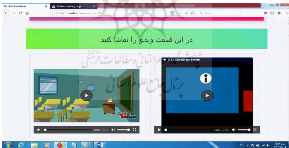
Figure1: The instruction phase for the DA group

The procedure for web-based DA classroom as treatment group represented in two facets of instruction and assessment: The content of each lesson in web-based DA was developed in the forms of visual and auditory learning style with IP of http://www.drfathii.com/vision . By web-based platform, we mean the program that has been designed by a computer and software engineer with IP of http://www.drfathii.com/vision . In the first step of instruction, each student entered the main page and did the tasks previously planned by the teacher. In the instruction phase of the DA group, the learners first watched the instructional films, read the grammar points and listened to the podcasts. In the assessment phase, the learners received preplanned quizzes and tests which were provided with hints. The phases of instruction and assessment and receiving hints are illustrated in figures 1-2.