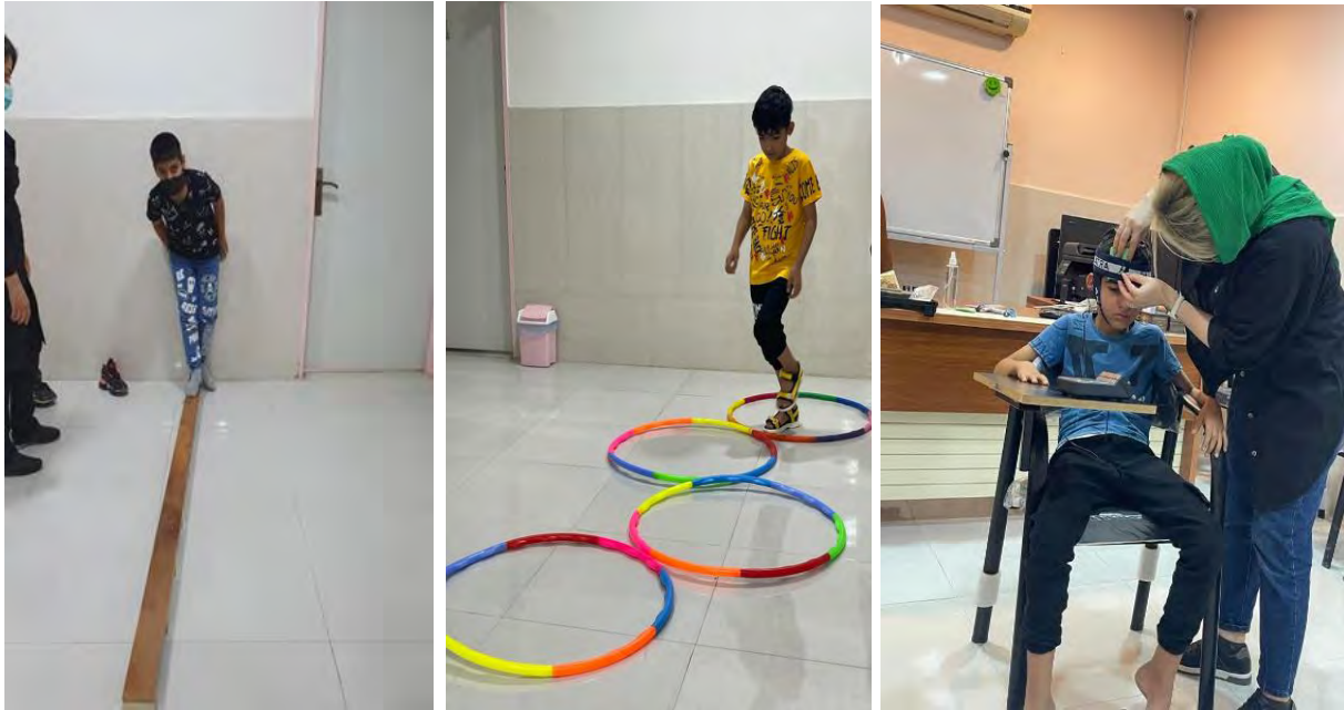
Figure 1. Neuromuscular and tDCS training