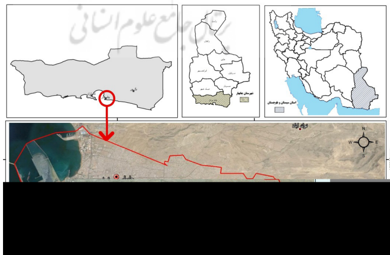
▲ Fig1. Political Divisions of Sistan&Balouchestan Province and Location of Chabahar

In field of housing index, the globalization process affects indirectly the improvement of facades, designs, materials and even the price of houses. In this index globalization has had the least effect on the item of "The easy access to housing" with an average of 2.77. As a result of globalization and the increase of trading and subsequently the urban excessive physical growth resulting from immigrations, the price of houses has raised therefore access to housing has fallen. With the boom in commercial activities caused by globalization the expansion of financial and credit activities is