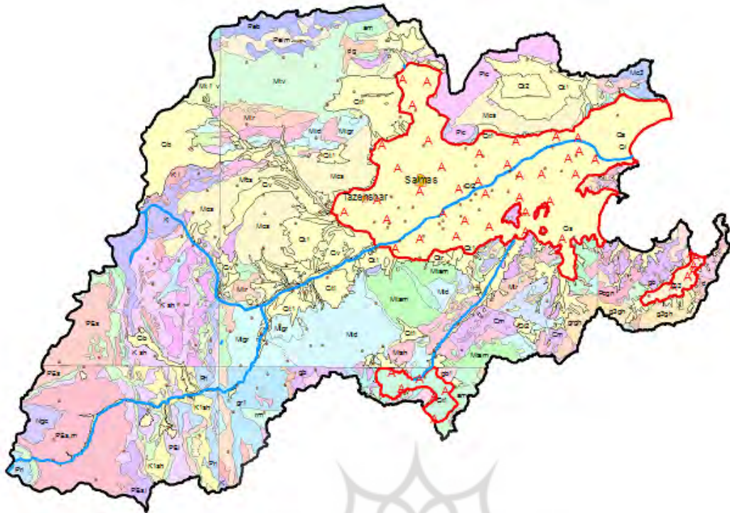
▲ Map1. The location of Basin and the plain of Salmas

200 m depth. Evaluation of pumping tests of 12 new wells in the plain of Salmas shows the increased amount of transmissivity of aquifer from margin to the Center of the Plain that is because of increased thickness of aquifer. In addition to the thickness of aquifer, along the Zola river, this increase can be effected by changes in way of gradation of alluvium and its high permeability. The maximum transmission capacity is more than 3000 square meters per day and a minimum is 50 square meters per day (at the edge of the plains) respectively. Calculated storage coefficients by exploration of wells do not have the appropriate spread on the plain. Salmas plain storage coefficient is estimated at around 3%. Formations with the possibility of storing water in them include Qom limestone formations and Ruteh with an approximate area of 150 square kilometers. Among Non-carbonate formations having storages with poor storage volume or being ineffective in nutriment of alluvial aquifers, Precambrian metamorphic rocks, sandstones of the Qom Formation and conglomerate and