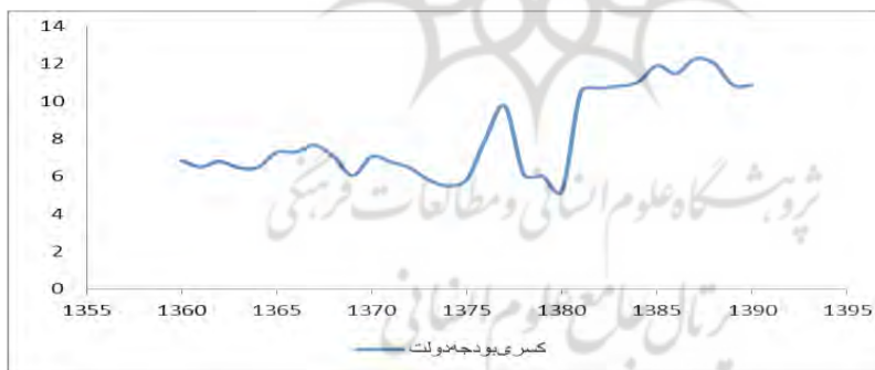
▲ Diagram 3. The changes of government budget deficit