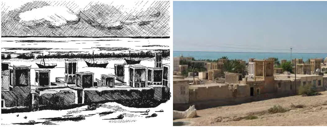
▲ Figure (3): the face of Laft port in the current situation and in the Qajar period, Source: (Lillian et al., 2010: 24).

ment, production continuity and prosperity crafts from time immemorial, Iran has played a role that is the existence of an economy based on agriculture and livestock. While the availability of raw materials for the manufacture of various types of vegetable and animal crafts, leisure and seasonal unemployment also causes generally can for crafts, provide good grounds for output and employment. Climatic conditions and climate variability and customs, customs and traditions in different regions and different crafts can create a variety of interesting and diverse images and designs to be effective. Iranian intrinsic interest in art, especially indigenous and traditional arts, which could pave the way for production or factor for demand works. Historically, each belonging to a specific period and show the impact of its cultural and artistic environment specific historical period and therefore today works with contemporary cultural treasures and the tablet is recorded as the actions and reactions of contemporary man, for future generations.