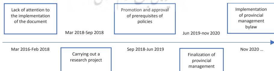
Figure 3. Time frames for the implementation of the bylaw of the provincial management of higher education

In the conducted research, policy implications were presented for the implementation of the SPHE document as a policy document in the country. Of course, researchers can present additional policy implications from various perspectives in future studies, building upon the narratives conducted in this research. The SPHE document is one of the most significant policy documents in the country's higher education system after the Islamic revolution. Its articles 1 and 2, which emphasize regional management, are particularly important in this document. The implementation process of this policy can be divided into five time periods (Figure 3).