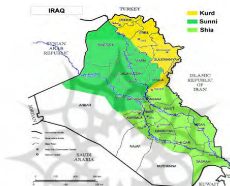
Figure (2): Map Iraq

The rise of Shiites in Iraq since 2005, as well as relations between Kurdish and Shiite leaders who play an influential role in new Iraqi government, and the institutionalization of a “de-escalation policy” approach in Iran foreign policy strategy, it seems that the bilateral relations are going through a peaceful process (Borna Beldaji,2005).