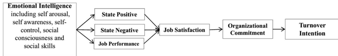
Figure 1. Conceptual model taken from the research (13)

The proposed conceptual model (Figure 1) depicts the relationship between emotional intelligence and organizational commitment, turnover intention, job performance and job satisfaction. Also, according to the proposed research plan, variables of job performance and emotions (state positive affect and state negative affect) can also mediate the relationship between emotional intelligence and job satisfaction.