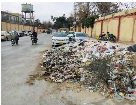
Pic 3. Waste Lying near Jinnah Road