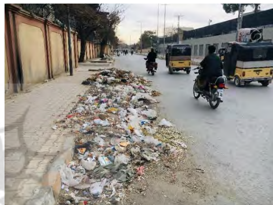
Pic 4. Waste lying on Inskumb Road