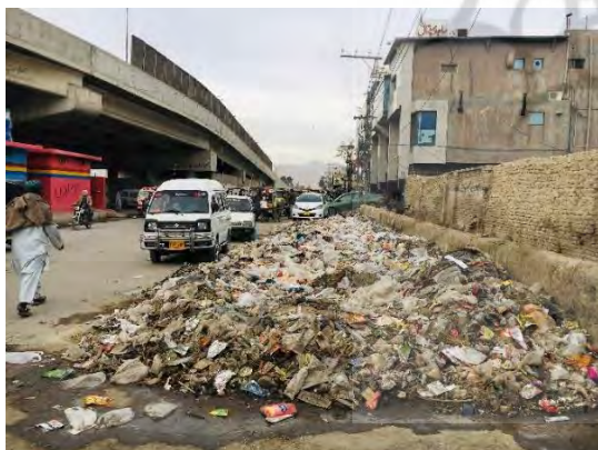
Pic 5. Waste laying near Akram Hospital