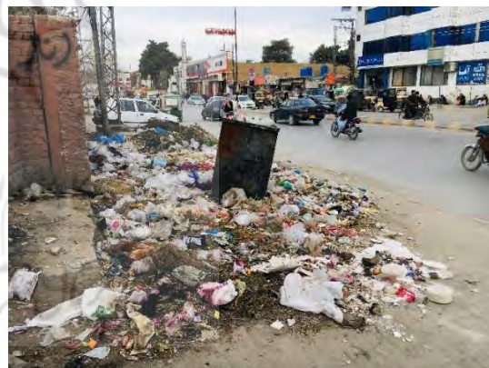
Pic 6. Waste collection point at Zarghoon Road