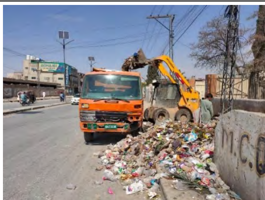
Pic 7. Waste collected at Sariab Road