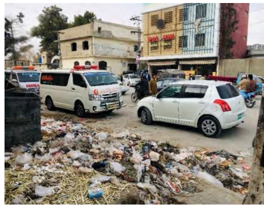
Pic 2. Waste lying on Sariab Road