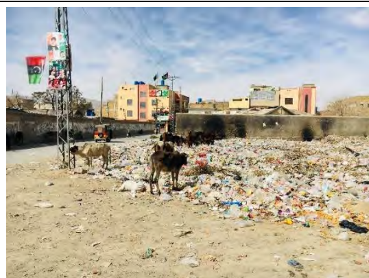
Pic 8. Waste lying near Railway Colony