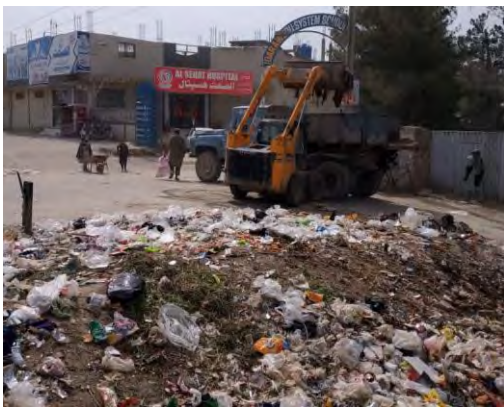
Pic 1. Waste collected by MCQ vehicle