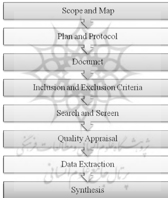
Chart 1. Steps of Systematic Review