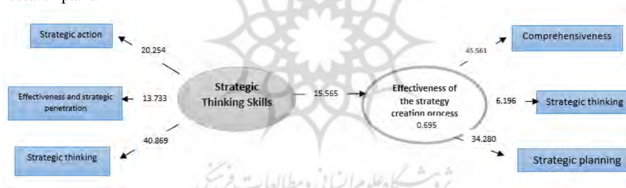
Figure 3. t-value of the casual path

T-value: The first and most basic criterion for assessing the fitness of the structural model is the t-value, which must be greater than 1.96 to confirm the casual path. Figure 3 shows the t-value of the research paths.