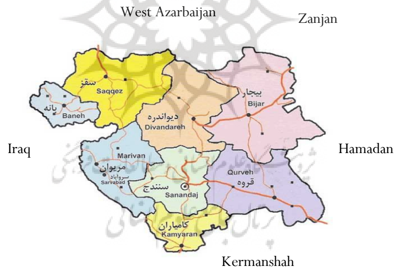
Fig 1. Relative position of Kurdistan province