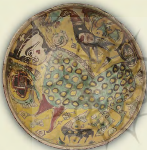
Samanid Pottery, 9 th - 10 th Centuries, Khalili Private Collection