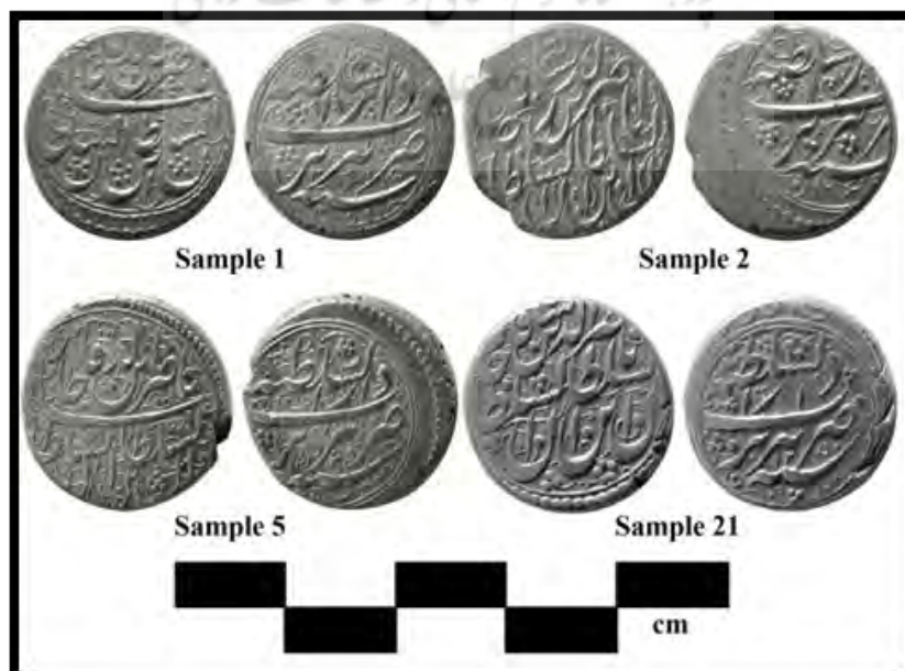
Fig. 1: Silver coins of Naser al-Din Shah of Tabriz Mint