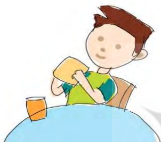
Figure 1 Context Picture

and the adverb maintenant 'now' appeared (11b) as a prompt word below the picture. After another two-second delay, the question (11c) was presented both as an auditory recording and on the screen below the picture. Participants were asked to answer the question orally, incorporating the prompt word. Their answers were audio-recorded. The target answer for this question is given in (11d).