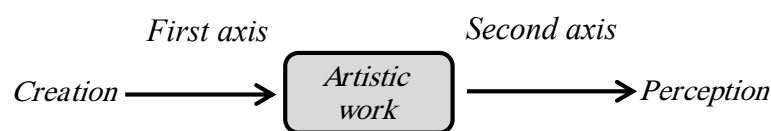
Figure 1: Two axes of the work of art based on Jauss's perspective

From Jauss' perspective, a work of art has two axes: creation and perception (Figure 1). In his point of view, the reader is not a mere discoverer, but he is a creator. He limits himself to neither representing the truth nor the history and the past. Jauss introduces the concept of the horizon of expectation to explain his theory (Namvar Motlagh, 2008: 90-100), i.e. how the audience, as the main element in perception, has an aesthetical perception that refers to his horizon of expectation.