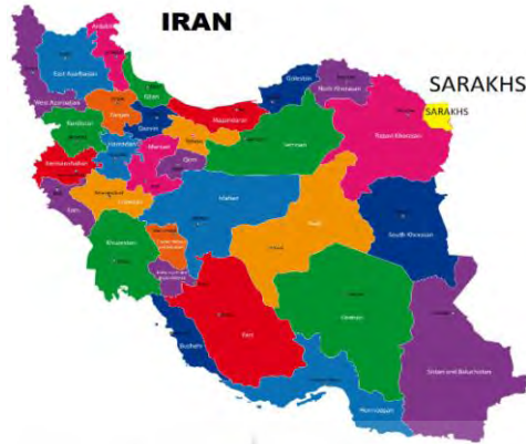
Fig 1: The Position of Sarakhs city

In this regard, the tourism sources and potential in Sarakhs and its suburbs are identified and their effects on increasing the sustainable income of the municipality are studied in this part of the research. The tourist attractions of Sarakhs are among the historical and cultural attractions, man-made attractions and the rest of the natural attractions.