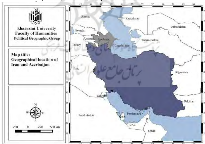
Map 1: geographical position of Iran and Azerbaijan

On the opposite side, Azerbaijan is located with an area of 86600 square kilometers at the confluence of Asia and Europe. It is located in the Caucasus region and it is Neighbor with Iran from South (Amir Ahmadian, 2004: 8). In this context, by the overview of space and existing fields, it can be concluded that Iran and Azerbaijan Can expand their relationships with each other and Have strategic relations due to geographic - geopolitical, advantages, Historical roots and cultural and religious, Ethnic and linguistic commonalities and geographical overlaps including Spreading Religious spaces(Shiite) And ethnicity (Azeri, Taleshi, etc.)