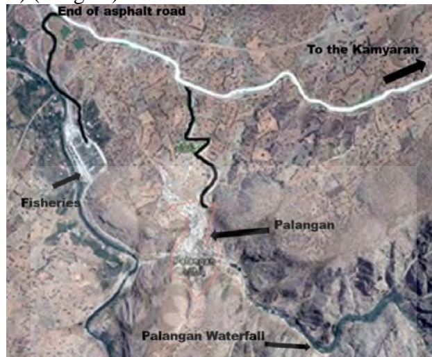
Image1: Palangan geographical location Source: Zandi, Najafi, 2017

castle of Hassanabad in Sanandaj around 16000 AD (around 980 solar and 1010 Lunar) has been the head of the Ardalan government for more than 400 years. Palangan was the center of the Ardalan government before the time of Haloo Khan Ardalan (969-995) (Zandi, Najafi, 2017) (Image 1).