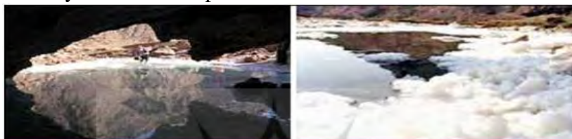
Figures 3 and 4- Salty caves in Hormoz Island

parts of island. Rock salt together with other stones are very crystalline and also suffered from deformation such that in the southern parts of island, one can see a network of great salty crystalline. Solubility and erodible of salt with strength of rocky blocks with it, like riolits, trakits and basalts caused many relieves and dry surface erosions in the salt dome of Hormoz and occurred a topography with many cracks and sharp wings and salty caves, particularly in the central part and west.