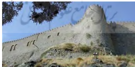
Figure 5- Hormoz Castle in Hormoz Island, a monument by Portuguese people

This castle that is located in the northern side of Hormoz Island and in the sea side is the most important castle remained from the era of dominance of Portugal people on the shores and islands of Persian Gulf. This castle established by the order of “Alfunso Albocork”, a Portuguese sailor on 1507 in a place called “Morta”. This castle has an irregular polygonal form. Its building is very strength and has walls with 3.5m in diameter with several towers with 12m in height. This castle comprises from ammunition warehouses, water reservoirs and rooms with arc ceiling. In the era of Shah Abbas that ended to the colonialism of Portuguese people in Iran, this castle could be occupied by Imam Goli Khan, a commander of Shah Abbas.