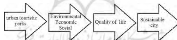
Fig. 1. Urban parks and city sustainability

Some cities have been developing their own sustainability indicators, to try and measure quality of life issues in a meaningful way. This has usually been done as a result of Local Agenda 21 consultations or in response to national government guidelines. 2 Beside environmental criteria (water and energy saving, waste recycling, transportation, etc.), quality of life issues are central to all the various definitions of a sustainable city. Aspects such as “amount of public green spaces per inhabitant”, “public parks” and “recreation areas” are often mentioned as important factors to make the city live able, pleasant and attractive for its citizens.