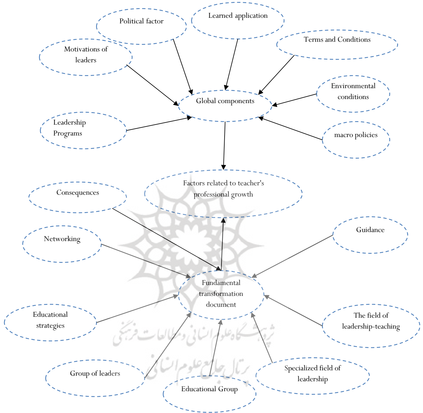
Figure 1. Professional logos of elementary teachers and key areas related to it

include a total of 18 models. These areas are summarized below along with the patterns associated with each one: