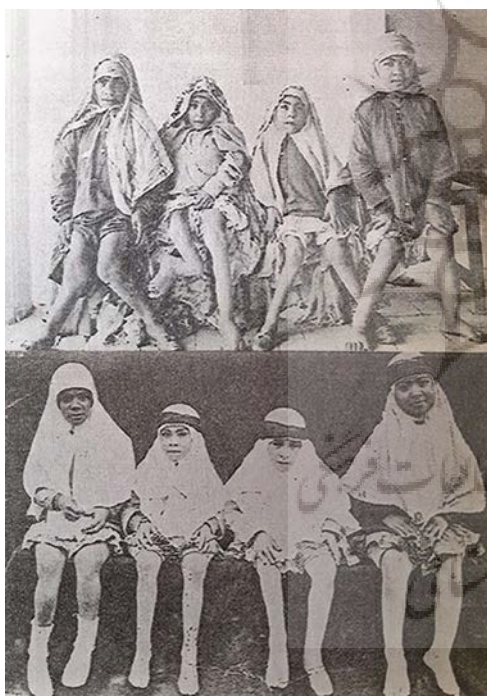
Fig. 4. Girls suffered from leg curvature due to carpet weaving before and after operation

In the field of education, the establishment of girls' schools, boarding schools, orphanages, and Sunday classes were among the main activities of the CMS women. The schools for