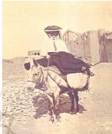
Fig. 5. CMS Missionary woman travelling on a mule, c. 1910

women, they answered questions from Iranian women about how they dress and live which were parts of their identities, and learned about Iranian lifestyles and health patterns (Rice, 1923: 64) (Fig.6.).