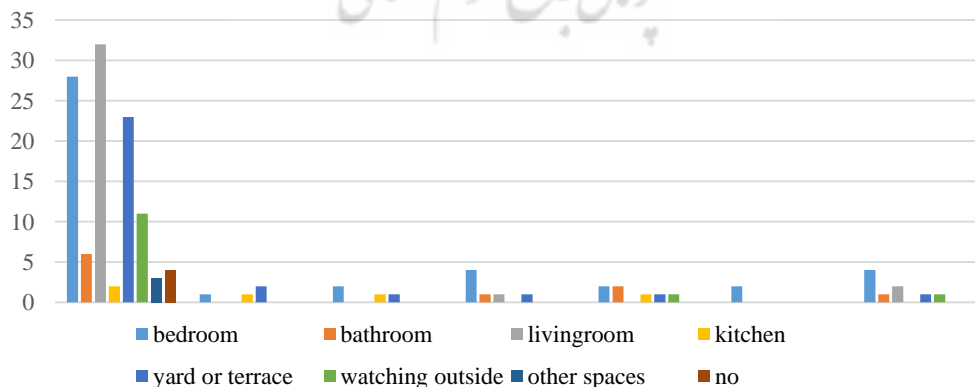
Figure 2. Frequency of spaces with the possibility of infectious contamination against spaces that reduce stress

Based on the findings of the Kessler Psychological Distress Scale and respondents' self-assessment of their mental condition, the majority of the study participants suffer from some level of anxiety and stress. On the home scale, we can refer to the indicators of stress due to the possibility of contamination of spaces and staying at home for a long time. In the analysis of these parameters, those house spaces that cause anxiety and stress or reduce such tensions (Figure 2) were investigated. It was initially found that from a community point of view, the entrance is the most contaminated place in the house. Based on the results of the correlation test, there was no significant relationship between spaces with infection possibility and stress-reducing places at home. On the other hand, a significant relationship was observed in different age groups (Table 3) in the assessment of stress-reducing places at home.