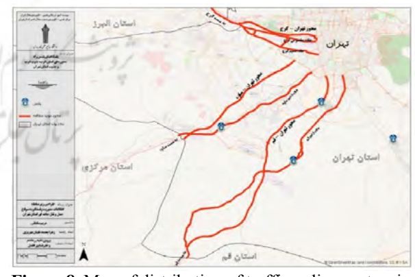
Figure 8. Map of distribution of traffic police centers in the communication routes studied

Road traffic police bases, which are distributed in the three exit points of the studied routes. The distribution of the traffic police centers in the communication routes studied is as described in Table 3 (Figure 8).