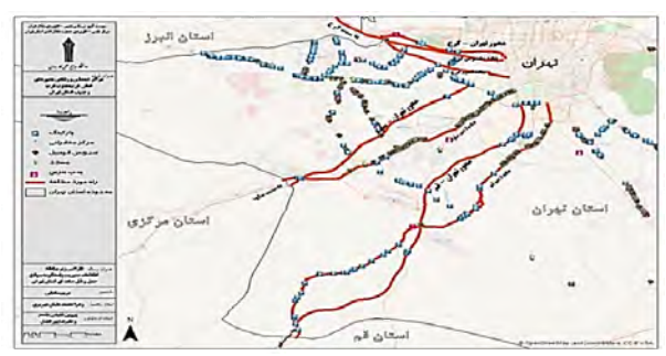
Figure 11. Map of distribution of service and welfare centers in the communication routes studied

Figure 12 represents the distribution of communication routes (rail, road, and air) in the study area.