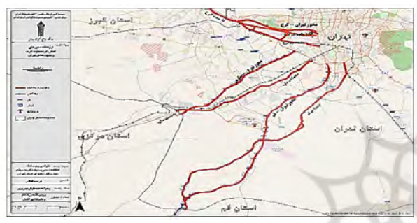
Figure 12. Map of distribution of communication routes studied

Figure 12 represents the distribution of communication routes (rail, road, and air) in the study area.