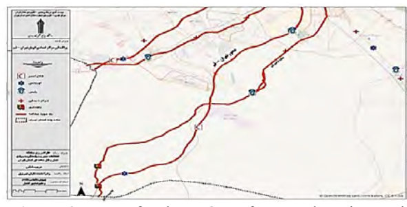
Figure 3. Map of Tehran-Qom freeway location and distribution of roadside relief centers in the study route

Tehran-Qom freeway: This 154-km-long route passes by Hoz-e Soltan or the Salt Lake of Saveh and is the oldest communication route between Tehran and the southern cities of the country. The Tehran-Qom route is one of the most important communication lines and the arterial road connecting Tehran to the southern provinces of the country, which due to its proximity to the holy shrine of Imam Khomeini and Golzar-e Shohada in Behesht-e Zahra, many citizens and pilgrims pass through it daily. The high volume of traffic on this route in all seasons, the presence of numerous industrial towns on the side of the freeway, and the existence of natural disasters such as very severe dust storms, which is one of the potential dangers of this freeway, have increased the risk potential in this route, revealing the importance of studying the route (13). The position of the Tehran-Qom freeway and the distribution of roadside relief centers on this route are indicated in the map displayed in Figure 3.