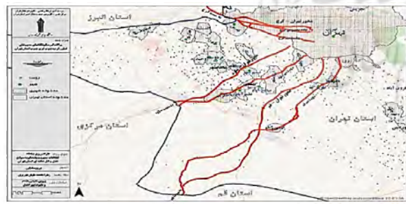
Figure 13. Map of distribution of human settlements in the vicinity of the routes studied

Another category of data included data on the neighboring settlements of the routes and the required descriptive information on the rural and urban settlements and the legal limits of cities. According to Figure 13, a large part of the study routes is adjacent to human settlements.