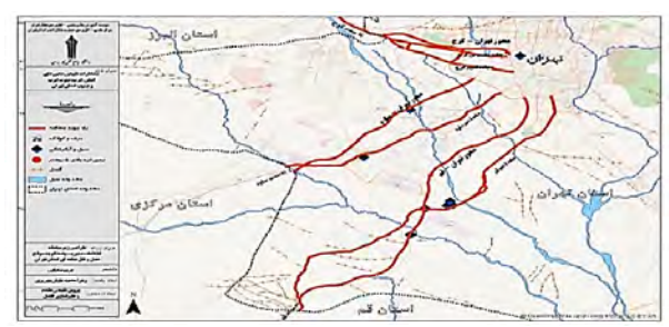
Figure 14. Map of distribution of natural disasters in the vicinity of the routes studied

information layers, with their distribution in the study area shown in Figures 14 and 15.