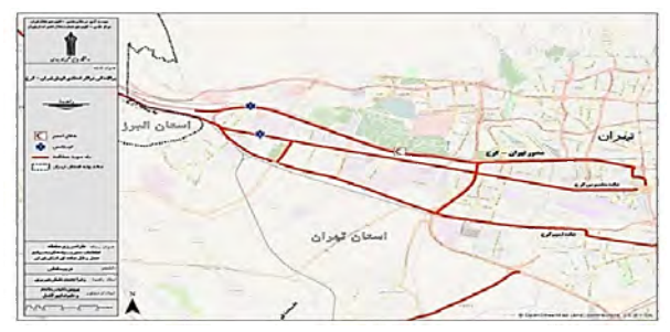
Figure 2. Map of Tehran-Karaj freeway location and distribution of roadside relief centers in the study route

is one of the potential dangers of this route, the importance of studying which for managerial planning in the context of road accidents should not be overlooked. Figure 2 demonstrates the location of the Tehran-Karaj freeway as well as the distribution of roadside relief centers on this route.