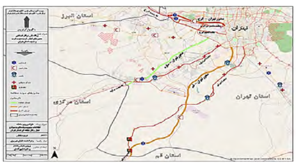
Figure 1. Map of distribution of roadside relief centers of the studied routes of Tehran Province, Iran

In most successful countries in the field of road transport safety, the provision of relief activities along the roads is divided into three sections of medical relief, road relief, and technical assistance. In Iran, the relief agencies in road traffic accidents are traffic police, emergency services, the Iranian Red Crescent Society (IRCS), and road maintenance organization, the distribution of which on the study routes is illustrated in Map depicted in Figure 1.