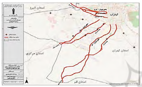
Figure 9. Map of distribution of medical centers in the communication routes studied

There were 5 medical centers in the study routes. It is worth mentioning that hospitals and medical centers in Tehran, Eslamshahr, Robat Karim, and Shahriar cities are responsible for admitting the casualties of road accidents of the west Tehran Province (Figure 9).