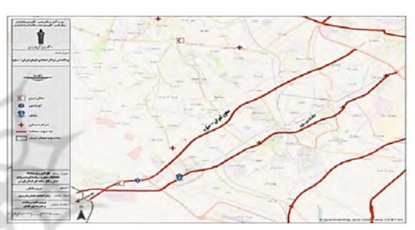
Figure 4. Map of Tehran-Saveh freeway location and distribution of roadside relief centers in the study route

Tehran-Saveh freeway: This route is 134 km long and connects Tehran with the cities of the western and southwestern provinces of the country. This route is also at risk of sandstorms due to its location in hot and dry climates and crossing desert areas like the Tehran-Qom freeway. The high volume of traffic in this route and the existence of industrial centers like other western and southwestern routes of Tehran Province in the margins of this transportation route is also one of the dangers that cause various accidents in this route and increases the importance of studying it to reduce the risks of road accidents. The position of the Tehran-Saveh freeway and the distribution of roadside relief centers on this route are indicated in the map shown in Figure 4.