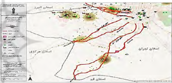
Figure 15. Map of distribution of unnatural events in the vicinity of the routes studied

Natural terrains can always contribute to the aggravation or relief of accidents. In the western and southern routes of Tehran Province, due to the relative uniformity of natural terrains and landscape, only the information of the permanent and seasonal rivers is given. Figure 16 shows the natural waterways of the west, southwest, and south Tehran Province.