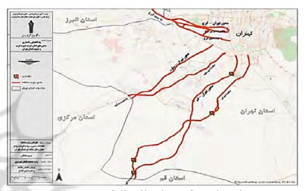
Figure 10. Map of distribution of road maintenance centers in the communication routes studied

bases on the Tehran-Qom route and the other two routes lacked a permanent road maintenance base. However, road maintenance teams are deployed along the road in occasional and seasonal plans to respond effectively to road accidents. The distribution of the road maintenance centers is as described in Table 5 (Figure 10).