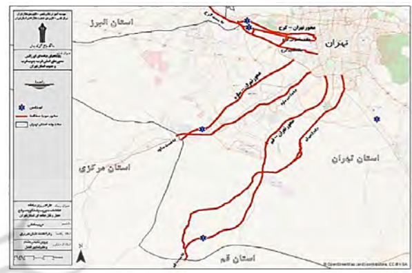
Figure 7. Map of distribution of road emergency bases in the communication routes studied

Road emergency bases, which include four active bases in the study routes. The distribution of these bases in the studied communication routes is as described in Table 2 (Figure 7).