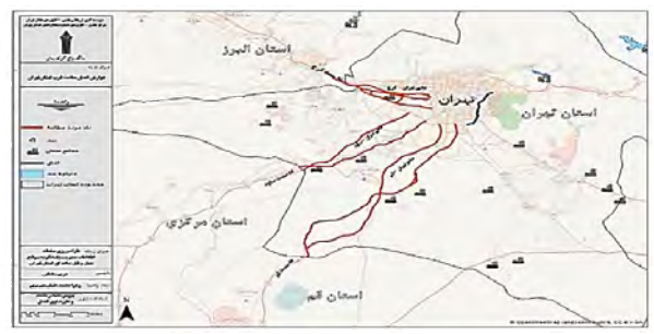
Figure 17. Map of distribution of man-made terrains in the communication routes studied in Tehran Province, Iran

Figure 17 shows the distribution of man-made terrains in the vicinity of the studied routes.