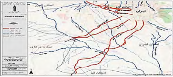
Figure 16. Map of distribution of natural waterways in the study areas of Tehran Province, Iran

Natural terrains can always contribute to the aggravation or relief of accidents. In the western and southern routes of Tehran Province, due to the relative uniformity of natural terrains and landscape, only the information of the permanent and seasonal rivers is given. Figure 16 shows the natural waterways of the west, southwest, and south Tehran Province.