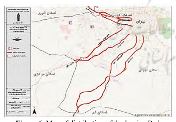
Figure 6. Map of distribution of the Iranian Red Crescent Society (IRCS) intercity relief bases in the study routes

Although there were a high number of IRCS centers in the region, especially in urban areas, due to the operational and specialized nature of the established teams and their operation at different times of the day, only permanent inter-city relief bases are shown. Figure 6 shows the dispersion of intercity relief bases in the studied routes.