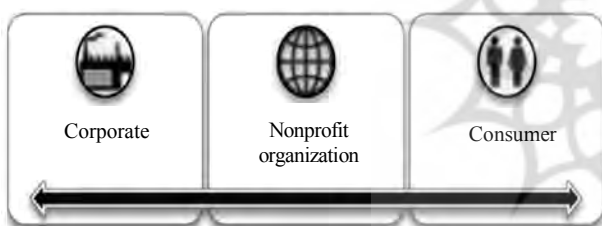
Figure 1. Scope of cause-related marketing (CRM) beneficiaries

societies is known as cause-related marketing (CRM) in which the nonprofit organizations collaborate with the corporations through access to new sources of fundraising and increasing social participation to benefit from the cooperation advantages. The popularity of this marketing tool is nowadays evident in the level of the involvement of corporates in social causes as it grew by 3.6% in the United States in 2017 and a total of 2.06 billion dollars has been dedicated for it (2). The term CRM was first coined in the 1980s and refers to campaigns where a corporate works with a nonprofit organization to help a particular social cause, whether through product sales or product use (3). In fact, CRM is a marketing tool that can be used to achieve a wide range of goals (4). Numerous studies have indicated that the emergence of CRM has increased the scope and breadth of the organization's beneficiaries beyond consumers and by integrating it with the nonprofit sectors (Figure 1), especially the sectors with knowledge and progress dealing with the social field for the improvement of social causes, such as human rights or sustainable development (5).