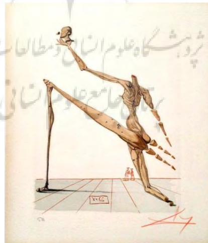
Figure 5. Canto Twenty Eight: Bertran de Born in the Eighth Circle