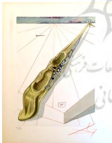
Figure 1. Canto Fourteen: The Blasphemers in the Seventh Circle

This landscape in Dali's image of canto fourteen, in fact indicates the meaninglessness of death, time and place in our dreams and unconscious mind. In Dali's painting, we also see that the skeleton seems to be on a stair-like surface that is falling from it. In Freud's The Interpretation of Dreams , stair represents sexual acts (Freud and Strachey 368). Maybe Dali, by drawing a falling skeleton from the stair, wanted to show that sexual desires cause human's fall.