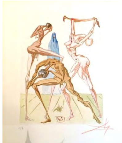
Figure 3. Canto Sixteen: The Sodomies in the Seventh Circle

who have very narrow and elongated waists and legs. By drawing these gay men, Dali wanted to show their physical and mental defects. In Dali's paintings, showing waist too thin, prolonged and facing feet intertwined with each other represent an emphatic anatomical deficiency (Dine 59).