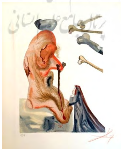
Figure 4. Canto Eighteen: The Fraudulent in the Eighth Circle