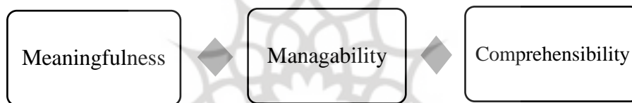
Figure 1. Antonovsky's theory of coherence (Antonovsky, 1987)

A sense of cohesion is an inner experience that gradually develops in adolescence to a relatively stable quality in an individual (Langeland & Whal, 2009). As a result, the sense of cohesion is the individuals' tendency to realize their world is understandable, manageable, and meaningful. The high levels of perceptibility and controllability are presented in the theory of sense of coherence. Therefore, by providing the opportunity to perceive stressful events in a controllable and predictable way, they can affect the occurrence of an individual's actional confrontation (Meiring, 2010).