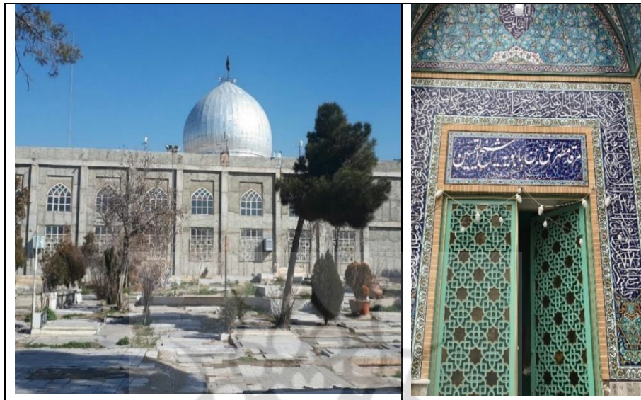
Picture 1. Ibn Babawayh Cemetery