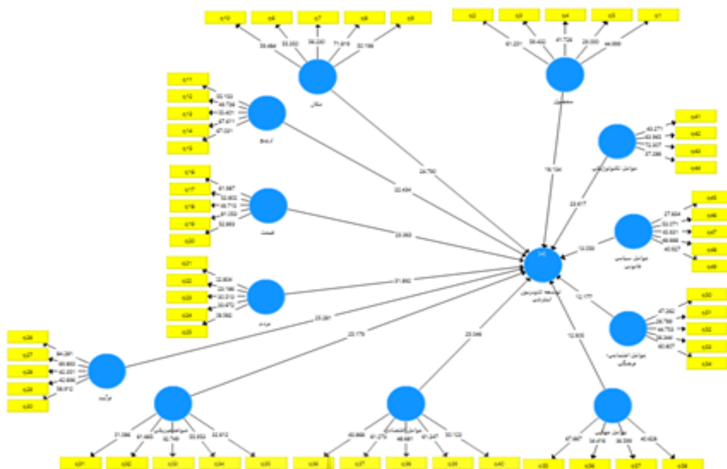
Figure 2. Conceptual model fitted to the significance of the parameters

The coefficient of determination is a more telling criterion than the correlation coefficient. The coefficient of determination is the most important criterion by which the relationship between one or more independent variables and the dependent variable can be explained. The coefficient of determination expresses the percentage change in the dependent variable by independent variables. According to the coefficient of determination of the fitted model, the research significant variables are shown in Table 5. Accordingly, about 98% of changes in the development of Internet TV are explained by the influence of 12 identified factors.