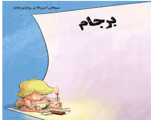
Figure 1. [US Polishes the JCPOA's Spirit], Shargh News Agency, June, 2, 2018

Another similar cartoon, figure 2, depicts Trump running uncontrollably toward a sign holder with the JCPOA and IAEA written on that, with TNT around his waist and ready to explode himself. An unknown figure is shouting, “bring his pills...he has gone crazy again”.