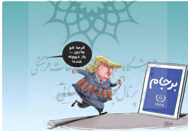
Figure 2. [Trump's Terrorist Attack on the JCPOA], Fars News Agency, May 24, 2018

Another similar cartoon, figure 2, depicts Trump running uncontrollably toward a sign holder with the JCPOA and IAEA written on that, with TNT around his waist and ready to explode himself. An unknown figure is shouting, “bring his pills...he has gone crazy again”.