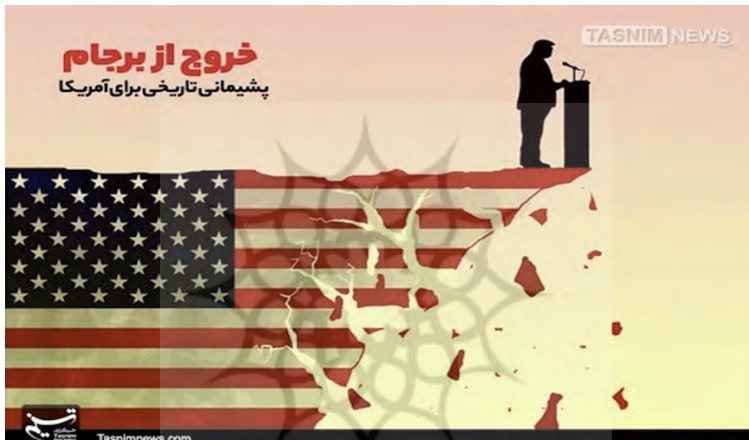
Figure 3. [Abandoning the JCPOA: A Historical Regret for the United States], Tasnim News Agency, May 8, 2018

US Shot Itself in the Foot: Another major framing of Trump's unilateral withdrawal from the JCPOA in Iranian newspapers, is representing Trump and by an extension the United States as the party that has deprived itself from the benefits of the JCPOA. The cartoon depicts Trump's podium on the verge of collapse and the US flag (as a symbol of American integrity and identity) being shattered. Similar cartons in Fars, Mashregh, Khorasannews and donya-e-eghtesad are published on the Americans as the major loser of Iran deal withdrawal.