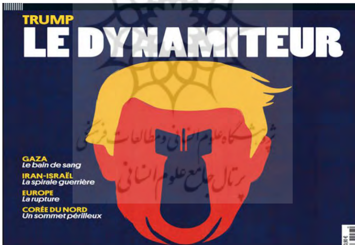
Figure 7. "Trump Le Dynamiteur" [Trump the Dynamiter], Courrier international , May 17, 2018.

Trump's Bellicose: The French vision of Trump's bellicosity has been reflected in cartoons attributing warlike characteristics to the current US president. On cover of the Courrier International , Trump's face, sketched by a drawing, recognizable by blond hair, is masked in the middle by a bomb thrown; which seems to be by an airplane. Arrangement of the bomb gives a particular effect to drawing with an upper part of the bomb having two "wings" conform to places where the eyes should always be, and are closed to lower part of this bomb constituting nose of the character. A big nose staged by a bomb recalls famous story of Pinocchio and his nose which becomes long when he indulges in lies. This arrangement of the bomb on this face also gives an impression of a clown face, involving a virulent criticism towards Trump who is designated as a dynamiter [le dynamiteur] by the title.