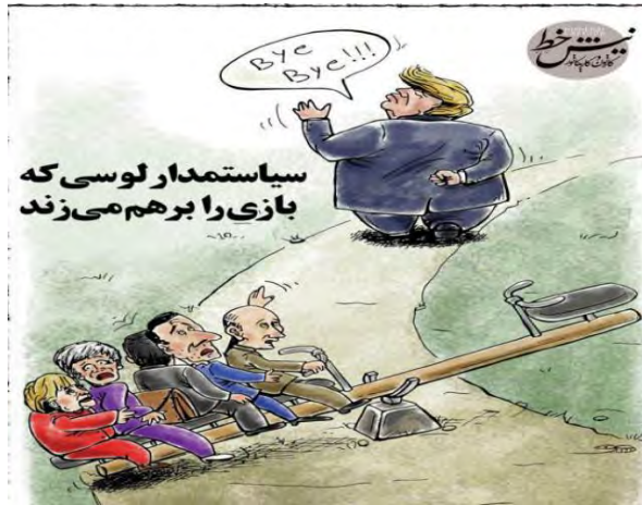
Figure 4. [A Spoiled Politian Spoils the Game], Nishkhand, 13 May, 2018.