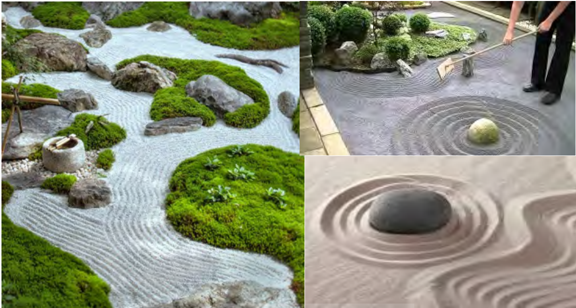
Fig. 2: Sand and gravel, which are reminiscent of the seaside