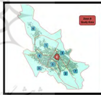
Fig.1. Location of the Historical Fabric of Shiraz City

Historic zone of Shiraz city with an approximate area of 378 hectares consists of a part of the central district of the city which today's identifies as zone eight municipality of Shiraz. In addition, this area is the initial core of emergence of the city; many central commercial activities, religious centers, services, and administrative activities are placed in it now and has considerable actual and potential capacities to boost tourism, pilgrimage, commercial, cultural and residential activities.