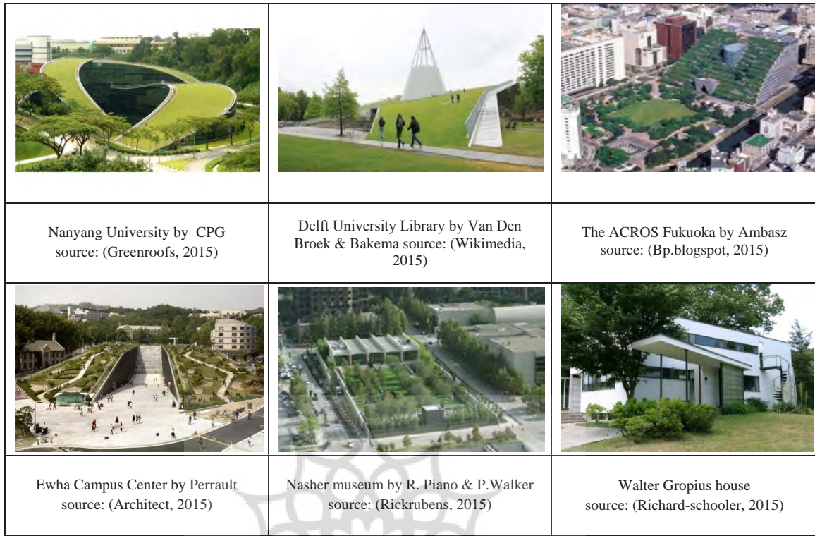
Fig. 3: Some built environments with connections to their surrounding and context by famous designers