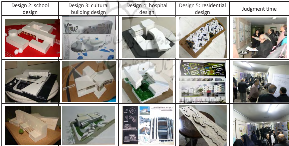
Fig. 4: Results and products of four design studios and their judgment procedure