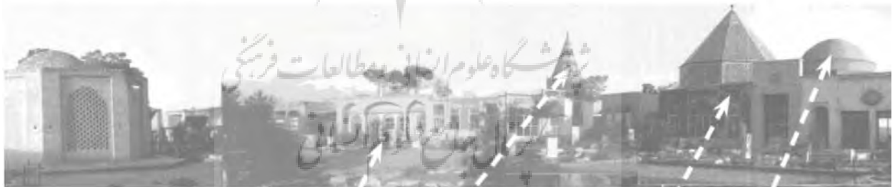
Fig. 4: Interventions made in Takht-e-Foulad Cemetery in Isfahan