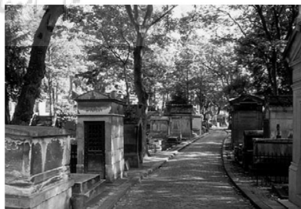
Fig. 3: Scenes from Père Lachaise Cemetery in Paris