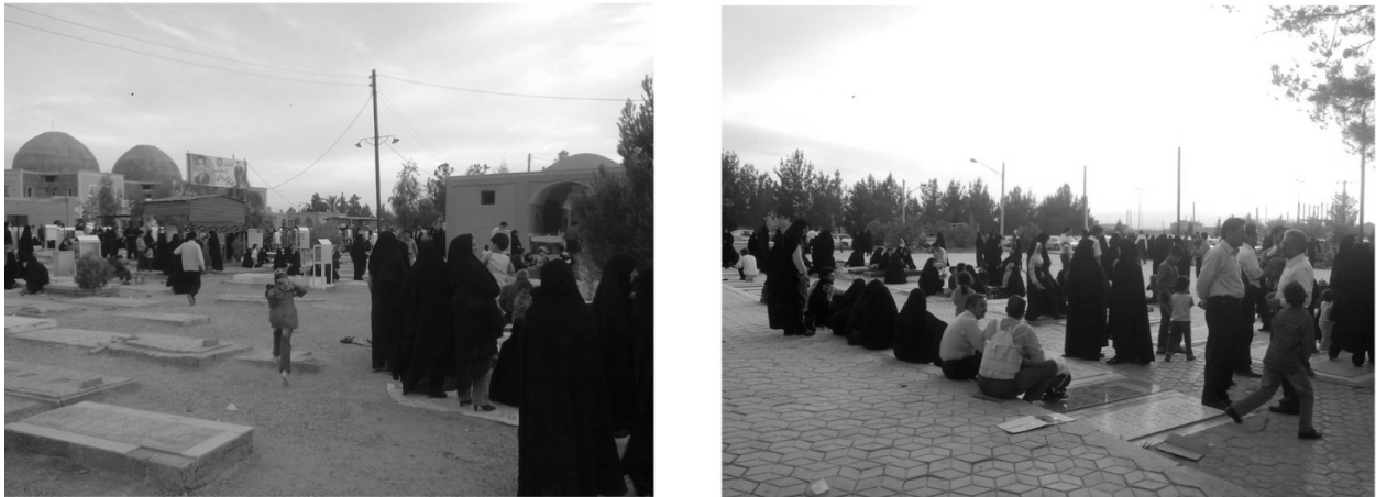
Fig. 2: Scenes from social interaction of citizens in cemetery (Cemetery of Ardakan, Yazd, Iran)